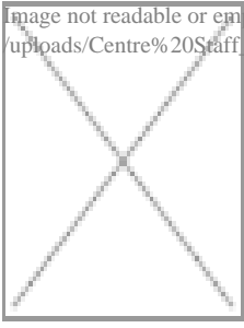
Image not readable or empty uploads/Centre%20Staff_Students/stefanidou-chrysi.jpg