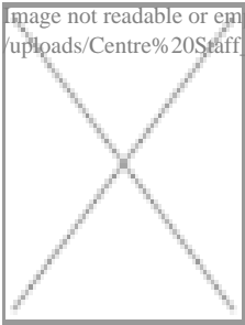
Image not readable or empty uploads/Centre%20Staff_Students/KatherineEllis.jpg